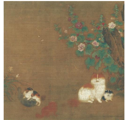
[Important Cultural Property] Attributed to MAO Yi Hollyhock and Kittens , 12th century, Color on silk, hanging scroll, 25.3 x 25.8cm Collection of the Museum Yamato Bunkakan Exhibition period: July 13-August 7, 2019