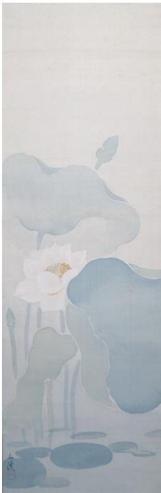
HARA Sankei, White Lotus , 1931 Color on silk, hanging scroll, 128.0 x 41.6cm