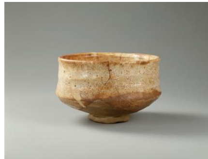
Shino-style Tea Bowl known as Umegaka (Scent of Plum Blossoms) Late 16th to early 17th century Ceramic, 8.3cm (height) x 13.5cm (mouth diameter) x 3.8cm (base diameter) Collection of the Gotoh Museum Exhibition period: July 13-August 7, 2019