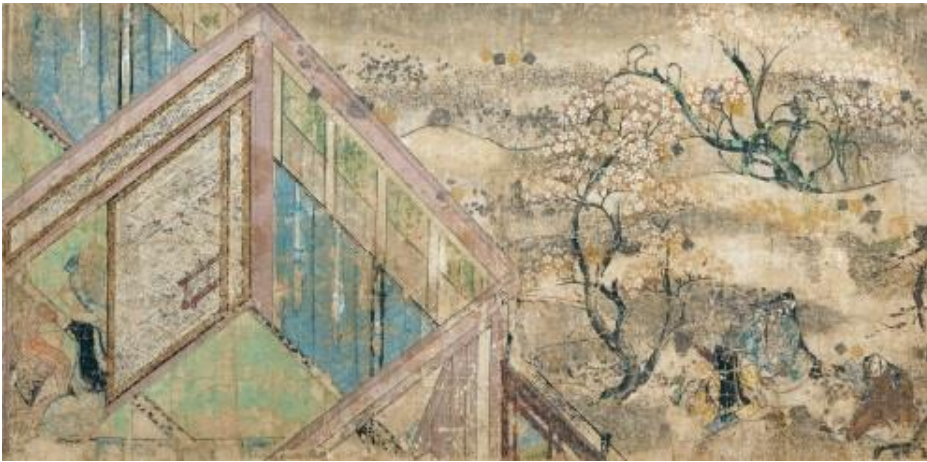
[National Treasure] Picture Scroll of the Tale of Nezame (detail), 12th century Color on paper, scroll, 26.0 x 533.0cm Collection of the Museum Yamato Bunkakan Exhibition period: August 9-September 1, 2019