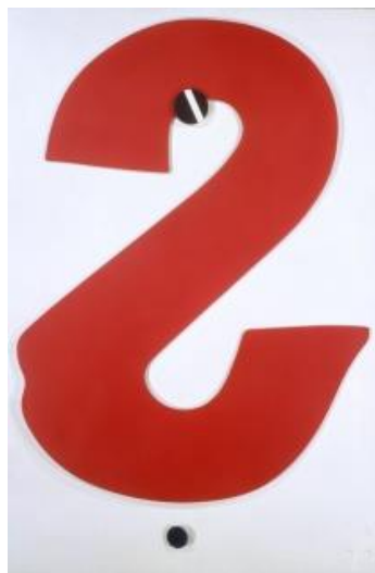
SAITO Yoshishige Crane 1967 wood, lacquer, 183.0×122.0cm