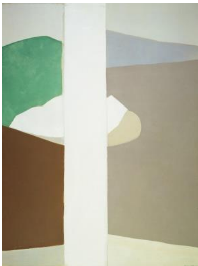
OKADA Kenzo Vertical 1964 oil on canvas, 265.8×198.4cm