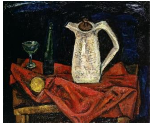
HYODO Kazuo Red Cloth and Pitcher 1975 oil on canvas, 60.6×72.7cm