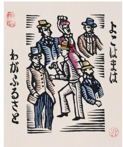
KAWAKAMI Sumio Yokohama is my Home Town 1967 woodblock print, colored by hand 26.6×20.1cm