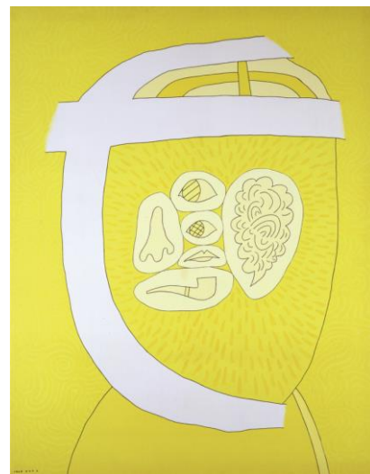
OKAMOTO Shinjiro Self-portrait with Bandaged Ear and Pipe, after Van Gogh 1968 acrylic on canvas, 228.0×182.0cm